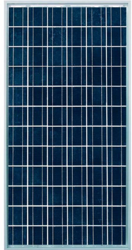
SCHOTT POLY™ 165/170/175/180